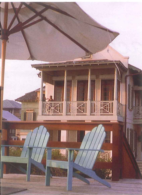
ABOVE Balconies and Adirondack chairs are quintessential Rosemary Beach.