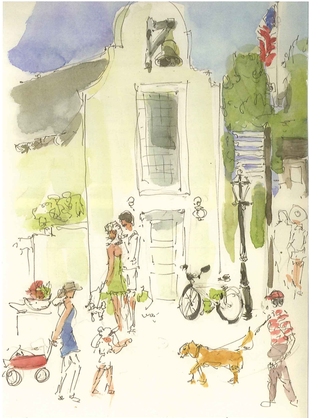
RIGHT Town Hall and the post office, bordered by dozens of shops and restaurants, are centerpieces of this pedestrian-friendly community.