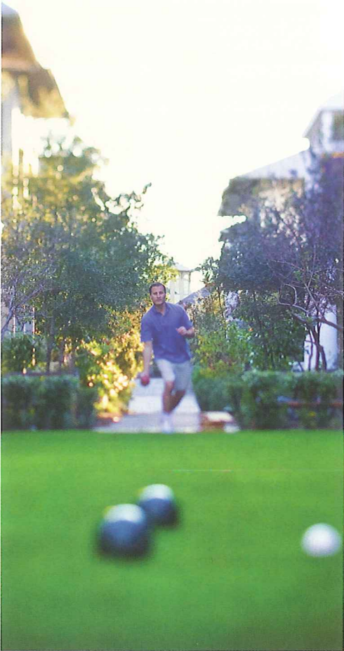
ABOVE Bocce ball, the official sport of Rosemary Beach, is just one of the activities visitors can partake in during two annual tournaments.