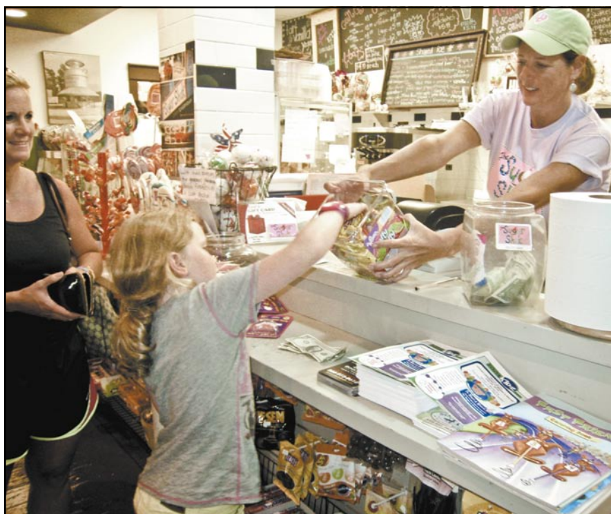
Nothing is better than a gift of free candy. Thanks Sugar Shak!