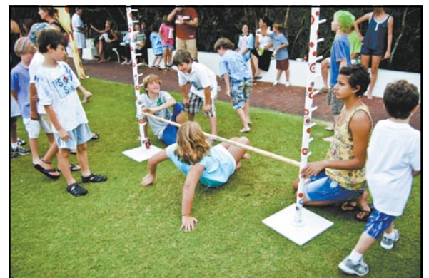
How low can you go? Fun at Kids' Rock the Block.