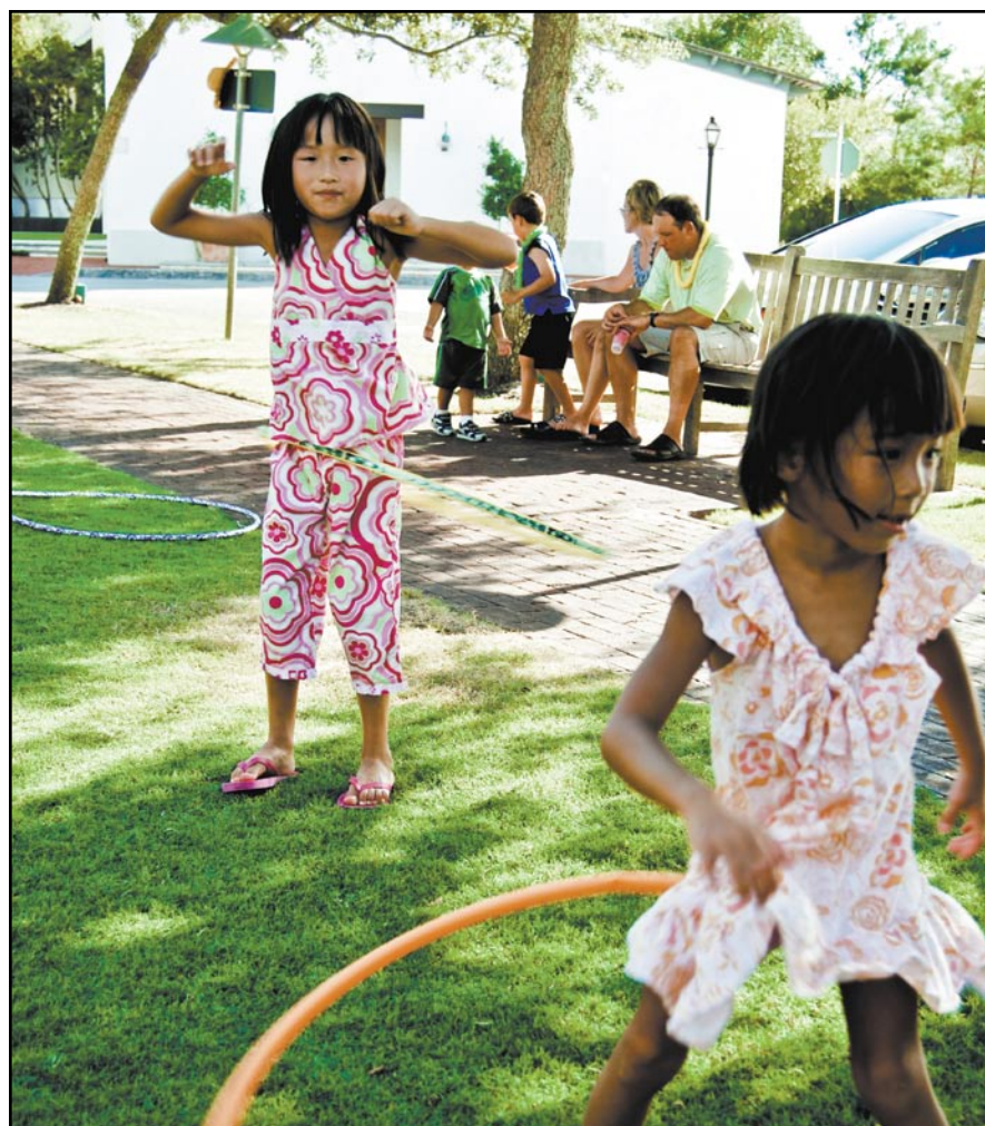
Hula hoops were a smash at the lawn party!

So remember, do a nice deed in Rosemary and you might be rewarded with a Rosemary Buck of your very own!